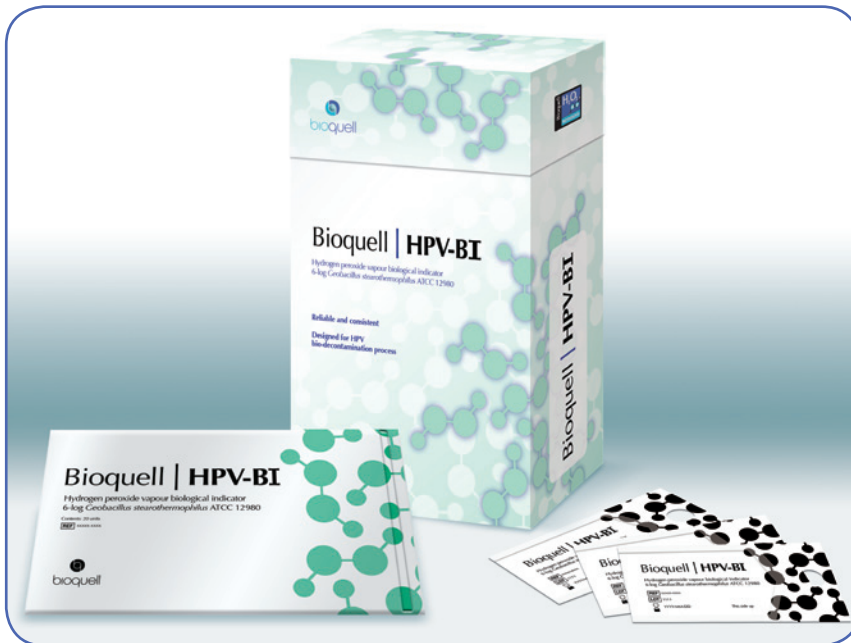
Image 1. Bioquell HPV-BIs provide assurance of a 6-log reduction in bioburden

Biological Indicator Type: 6-log Geobacillus stearothermophilus ATCC 12980